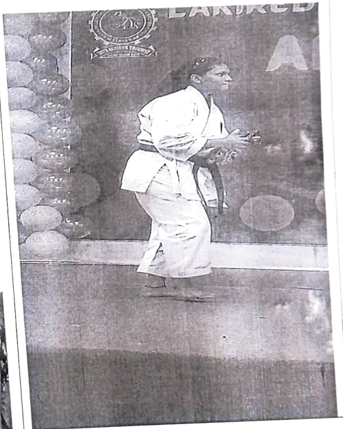
First batch students along with their faculty and cultural events